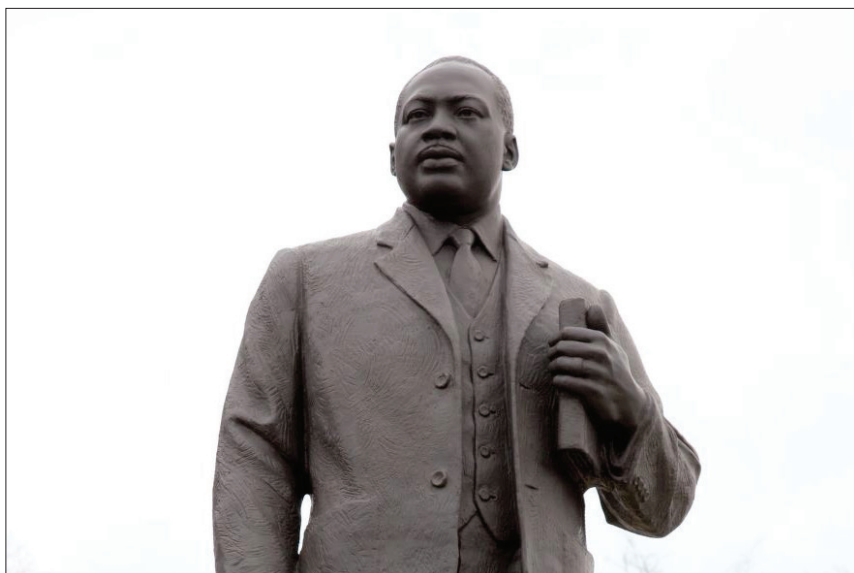
Figure 1: Traditional-style monument honoring Dr. Martin Luther King Jr. in Kelly Ingram Park.

Finally, the Four Spirits counter-monument (described below) stands across from the 16th Street Baptist Church, the most well-known corner of the park. Once visitors enter one corner, they begin on a circular path called the “Freedom Walk,” where counter-monuments bear the stories of the difficult history that took place in this historical square. Throughout the Freedom Walk, visitors physically walk inside the counter-monuments, causing one to reflectively empathize with the emotions of experiencing this racist terror, while simultaneously being forced to consider which side one stands on today—the side with the activists standing up to racial injustice, or the side passively watching systemic and institutionalized racism continuing in U.S. society today.