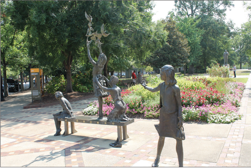
Figure 6: Four Spirits counter-monument in Kelly Ingram Park.

Four Spirits. Located at the northwest entrance of the park, the Four Spirits counter-monument is a moving tribute to the four African American girls murdered in the 16th Street Baptist Church bombing on September 15, 1963. The sculpture portrays the innocence of the young girls, as they seem to be gathering to talk and dance. One girl stands atop a bench with her hands raised, setting doves free. The counter-monument embodies the contradiction of the girls' innocence and the racialized hatred that led to their death. Artist Elizabeth MacQueen created the sculpture for the 50 th anniversary of the church bombing in 2013.