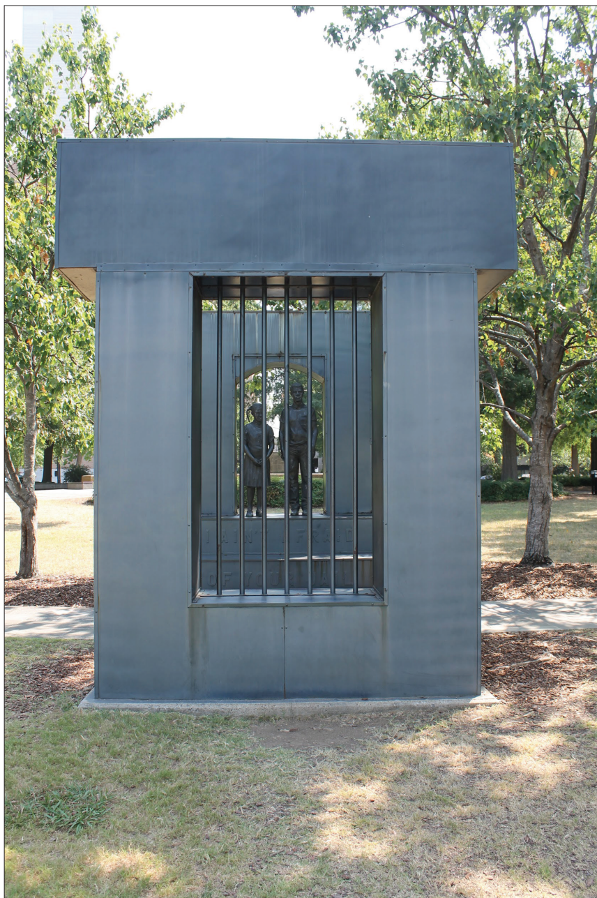
Figure 3: The Children's Crusade counter-monument in Kelly Ingram Park.