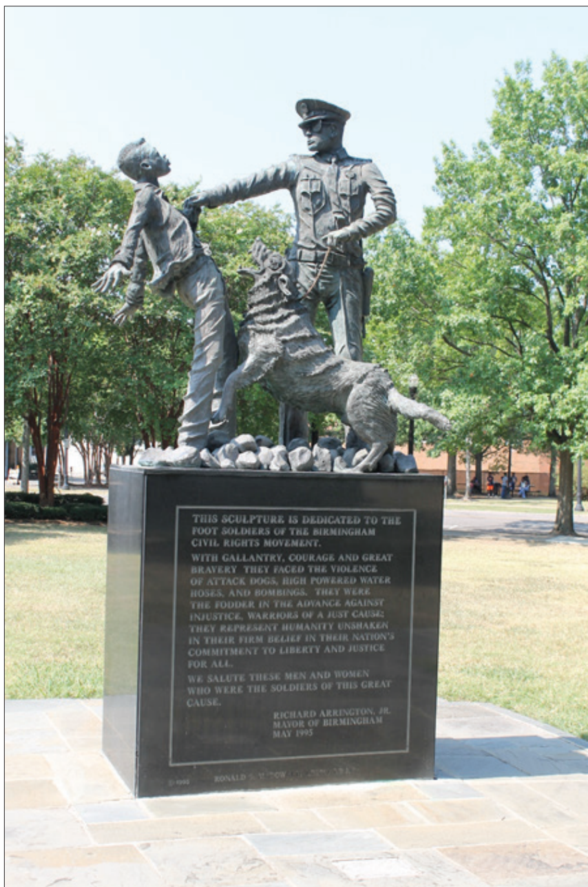
Figure 5: The Foot Soldier counter-monument in Kelly Ingram Park.