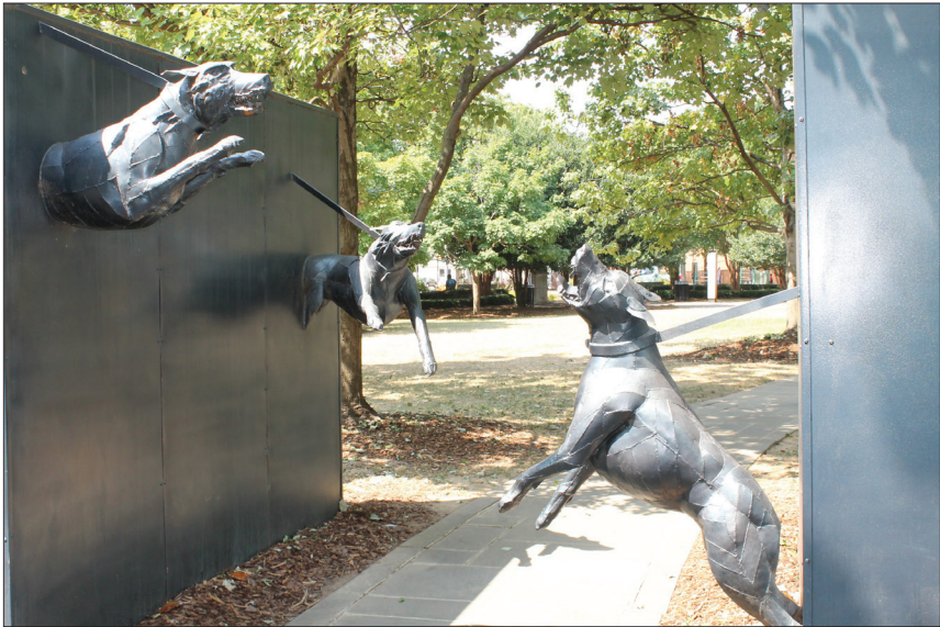
Figure 4: Attack Dogs counter-monument in Kelly Ingram Park.

“Segregation is a sin.” The structures align in such a way that visitors standing on one side of the counter-monument will seem to look through a jail cell to see the children.