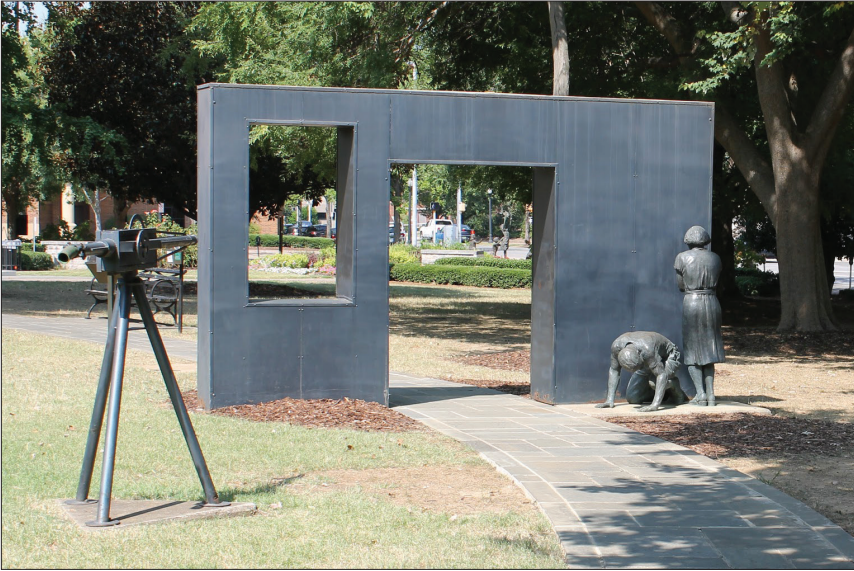
Figure 2: Water Cannons counter-monument in Kelly Ingram Park.