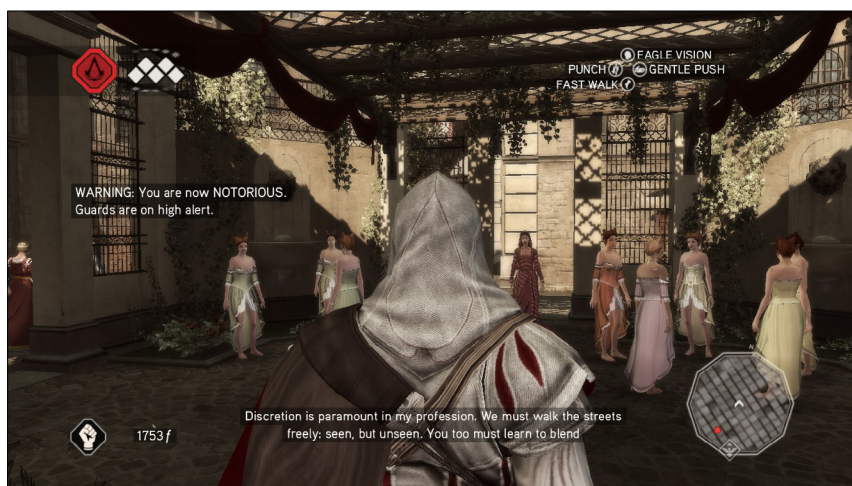
Figure 8: Florentine courtesans training the protagonist of Assassin's Creed II to blend in a crowd.

combat skills as she introduces the neophyte, Desmond, to the shadowy conspiracies underlying the story. By contrast, the mother of Desmond's fifteenth-century banker ancestor, Ezio Auditore, pursues art purchasing, an activity more appropriate of Renaissance Florentine ladies. When exiled from Florence and forced to manage the family estate, Ezio's sister Claudia even complains that she has never had to work before. The designers of Assassin's Creed II , however, do not portray all Renaissance Italian women as so sheltered. On the contrary, the madam of a Florentine bordello and her charges train Ezio to pick pockets and maintain a low profile while the city's authorities hunt him. Of course, this brings the game—and the player—to a chamber filled with seductive women (see Figure 8 ) whose “role” is in prostitution. Later, in Venice, a female thief trains Ezio further in the “climbing-leap” technique, important for his success as an assassin. Just as important as the roles of women in Assassin's Creed II are those of men. The male honor code is on full display in this game, replete with family rivalry, vendettas, and assassinations.