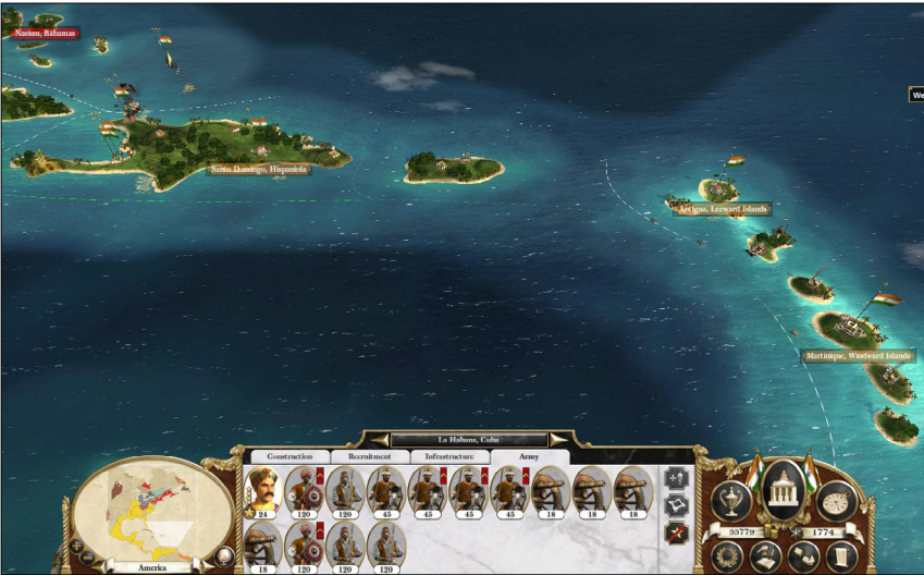
Figure 2: The eighteenth-century Caribbean under India’s occupation, Empire: Total War .