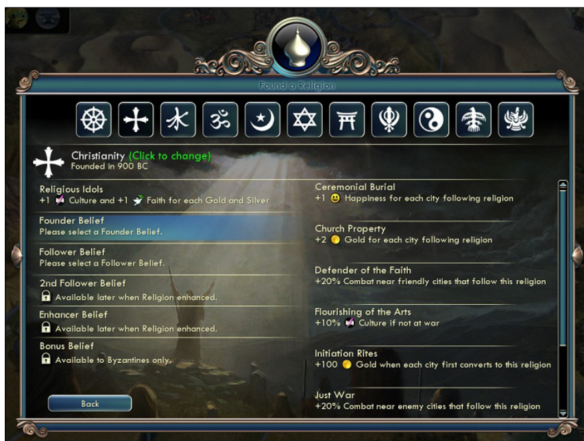
Figure 5: Religion screen, Sid Meier's Civilization V: Gods and Kings .

among historians. Some argue that their discipline should not indulge in counterfactual speculation, but solely in what actually occurred. Others have retorted that to identify causal relationships is implicitly to speculate on what would have occurred if those causes had not existed, thereby considering alternate outcomes as well. The latter view may be more popular among scholars than it used to be, since recent historical scholarship has increasingly emphasized contingency and the role of chance.