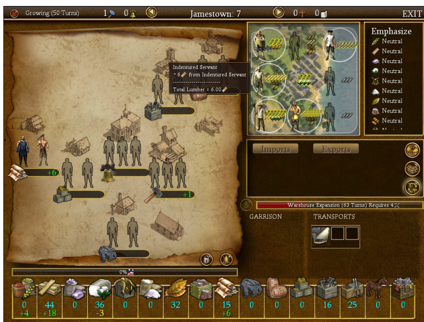
Figure 4: Jamestown's city screen, including accompanying plantation squares (upper right) without slaves, Sid Meier's Civilization IV: Colonization .

Slaves are also absent from Empire: Total War . This simulation of warfare and economics across much of the Americas and Eurasia has much to recommend itself as a tool for understanding the eighteenth-century world system. In particular, its technology tree (an in-game diagram that shows options a player can research and develop) does not simply focus on armaments industries, but also on the underlying process of industrialization and its correlation to the development of Enlightenment ideas. Nevertheless, in terms of modeling trade specifically, it falls far short of an adequate simulation of eighteenth-century global economics. In addition to the three theaters of military and political action (Europe, North America, and South Asia), the player can conduct maritime trade with South America, sub-Saharan Africa, and Southeast Asia. The rewards of parking, and defending, your "East Indiaman" in the ports of these regions are, however, not specific commodities such as spices, tea, raw cotton, ivory, or slaves, but abstracted wealth signified by gold coins rising from the ship. Since the wealth is abstract, the player is never shown where it is bound in the short run. Spices might go to European and white American customers; raw cotton to lucrative textile mills that the player is encouraged to build