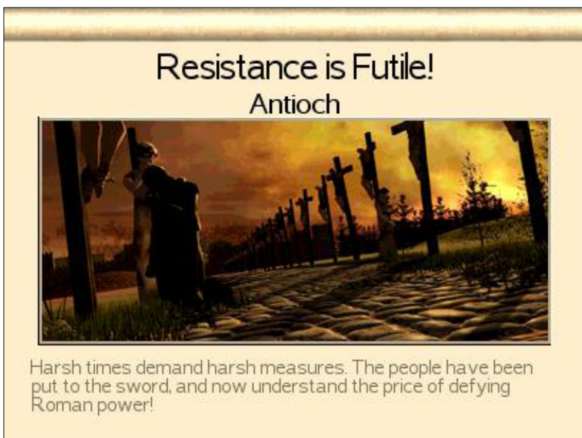
Figure 6: The result of choosing to destroy a city in Rome: Total War .

Nor does it allow a player taking on the role of the United States to see the effects of incendiary or nuclear bombing. Indeed, the hate speech laws of many European countries forbid game developers from using the swastika as an emblem for German forces during World War II, much less attempting to depict the Nazi Holocaust. Paradox Interactive shuts down posts on its forum that protest this policy. 31