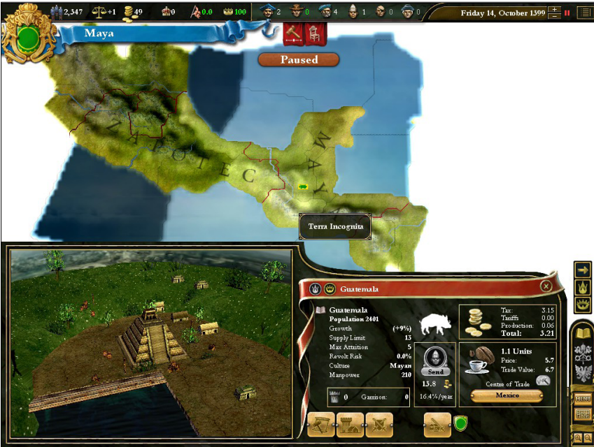
Figure 3: Coffee, in pre-Columbian Guatemala, Europa Universalis III .