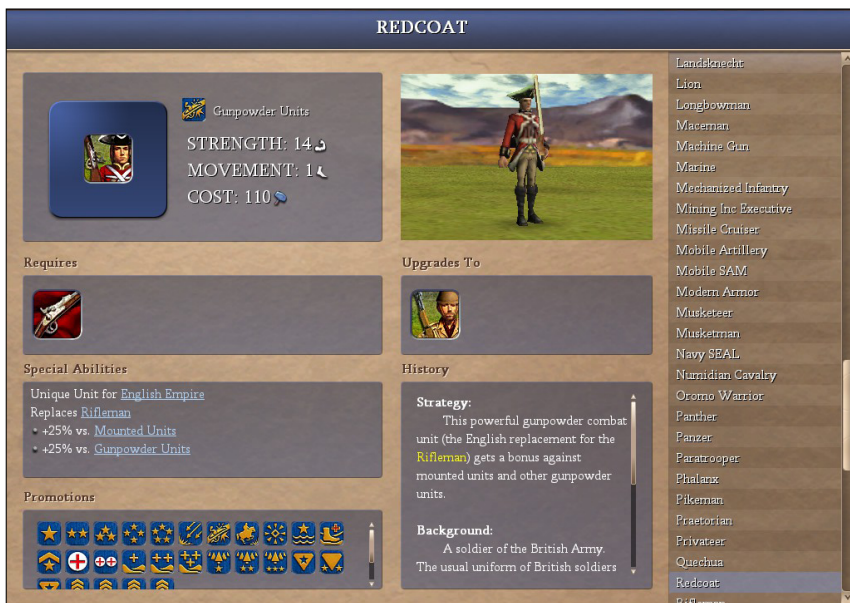
Figure 1: “Redcoat” information screen from Civilization IV .

marriage, even they boil down to mathematical calculations, increasing the odds of political stability and happiness. While scholars have criticized Sid Meier’s creations for their Western triumphalist and capitalist orientation, the treatment of religion in both Civilization and CivCity: Rome bears the clear message that it is, to quote Karl Marx, “the opiate of the masses.”