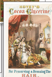
Front and Rear Covers from The History Teacher NHD Editions

For 25 years, The History Teacher has published the winning student essays from each year's National History Day