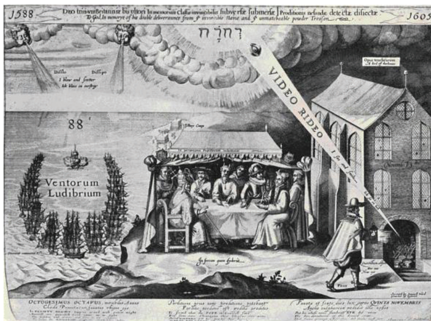
Figure 1: The Double Deliverance 1588:1605, engraving by Samuël Ward, 1621.

sources. 1 Students have to be able to interpret a range of primary sources, including visual media such as photographs, paintings, or prints. In the examinations, students address questions on the ideas, views, and relationships indicated in the sources and on the usefulness and reliability of the sources as historical evidence. However, gleaning meaning from images that they have not been confronted with before can be a challenging task for students. Interpretation requires students to synthesise their understanding of what they see before them with their knowledge of historical events and ideas.