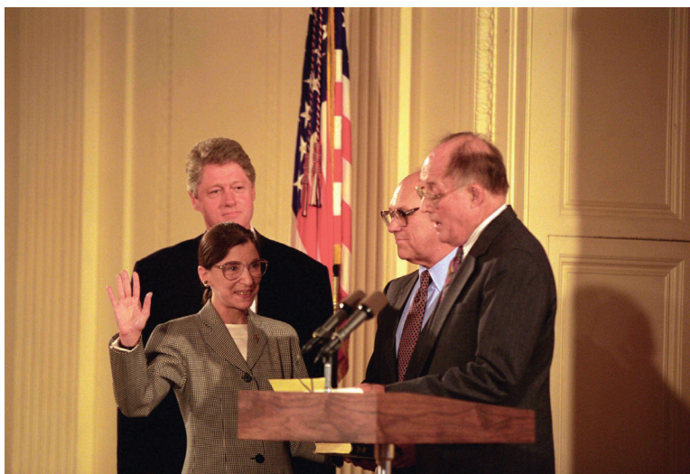
Judge Ruth Bader Ginsburg Being Sworn in as Associate Supreme Court Justice (August 10, 1993)